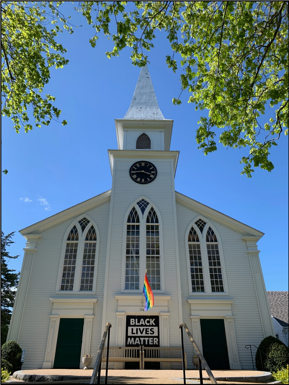
Sign hanging and photo credit to Jennie Mignone, FPBUU Sexton